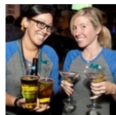
Tappy Birthday at Tap