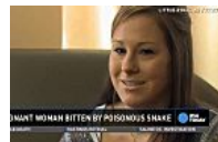
Pregnant woman delivers early after venomous s... Sep 18, 2013